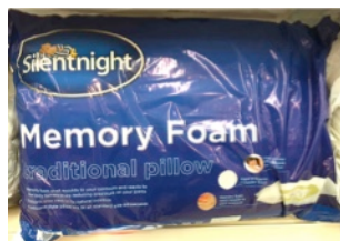
MEMORY FOAM PILLOW