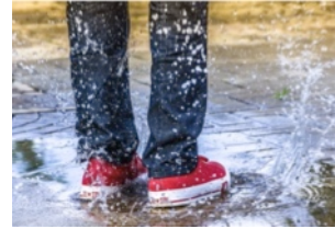
WATERPROOF NANOCOATING ON FOOTWEAR