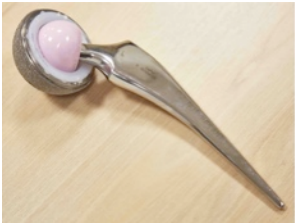
TITANIUM HIP REPLACEMENT